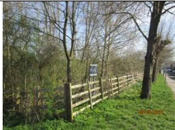
The Canyons, photo taken from Walker Street