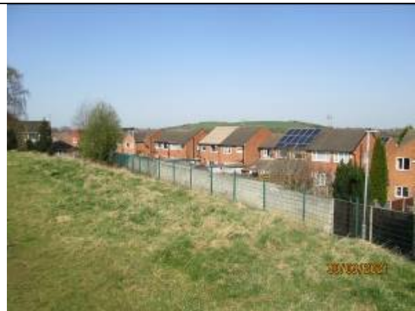
Rear of properties on Garden Road to the north of the site