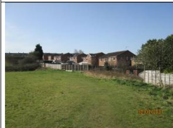
Rear of properties on Atherfield Gardens, to the west of the site