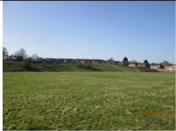
View across the field looking south west. The steep bank separating the main site from the proposed open space can clearly be seen