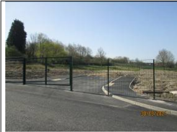
Existing entrance to former school buildings on Lynncroft