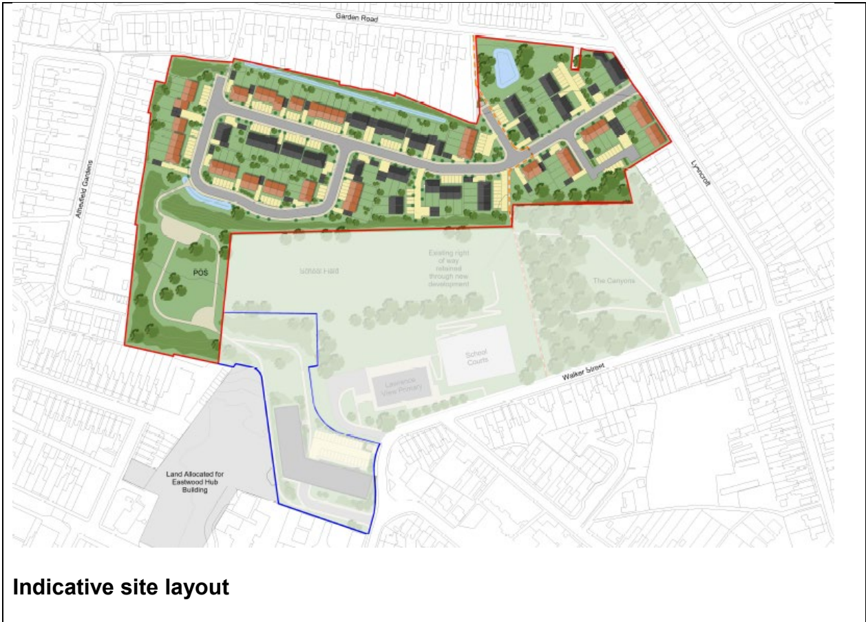
Indicative site layout