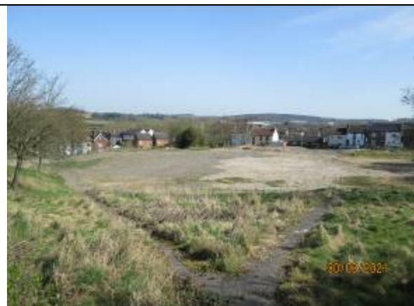
Area formerly occupied by the school buildings. Houses on Lynncroft, to the right, and Garden Road, to the left, beyond the site