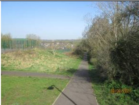
Public right of Way through the site