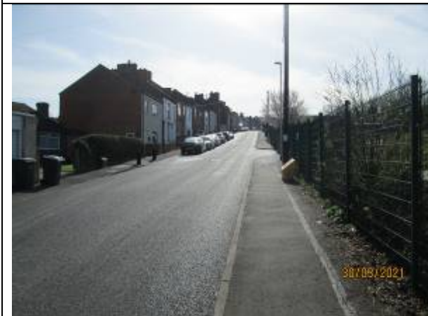
View along Lynncroft looking south east. Entrance to site on the centre right