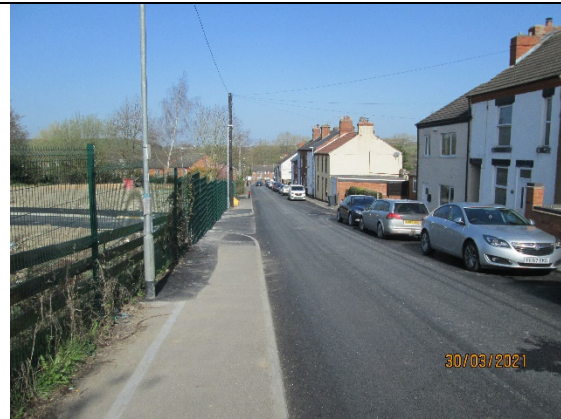
Existing entrance to the left, view looking down Lynncroft toward Garden Road