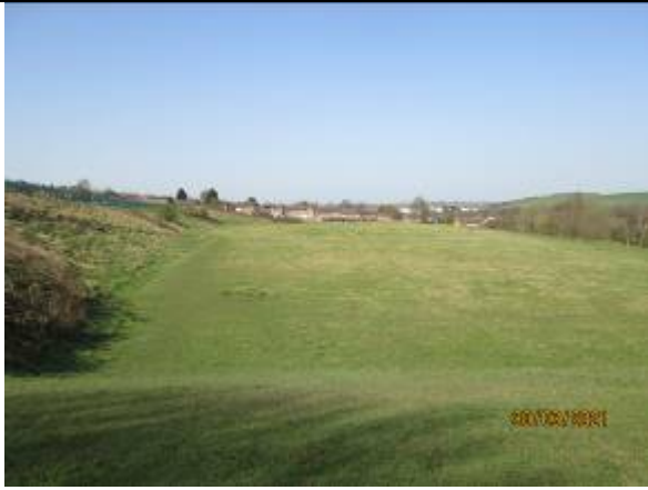
View across the site from the east, looking toward Atherfield Gardens